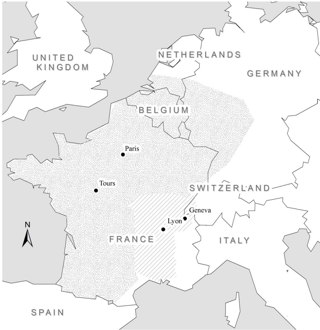
Land held by Franks at the death of Clovis (511) Burgundian kingdom